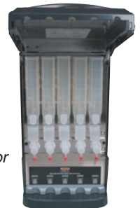
Top hinged door inside view

For current specification sheets and other information, go to www.bunn.com .