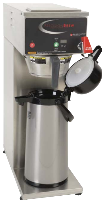
Model B-SAP (Airpots sold separately)