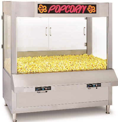
Countertop ReadyServe Model 2785 (001) shown