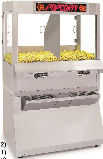
ReadyServe Model 2785 (002) shown on Base Model 2779 (001) (items sold separately)